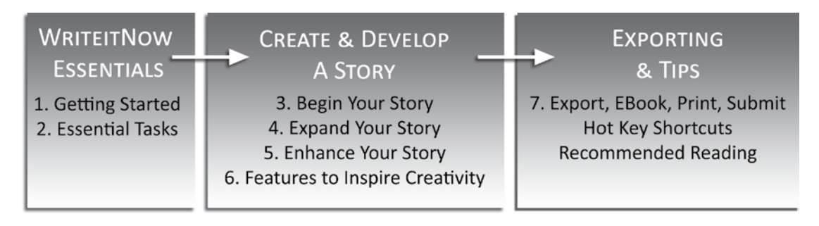
Figure 1.1 Making the Most of WriteltNow 4 book structure.

You can use the tools we discuss in this section at any stage of your writing. We present them in a logical order that you might use them in, but use them in any order. WriteItNow was designed to suit your personal writing style.